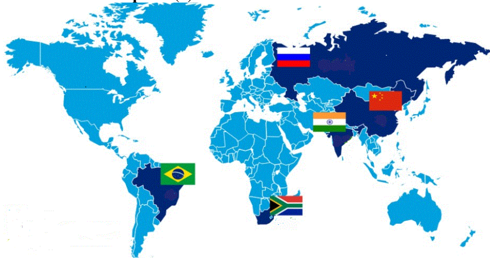
Map No. (1) shows the BRICS countries

The West believes that Russia hoped to use the BRICS group to increase its weight in the international system and that Russia's diplomacy in the BRICS group aimed at creating a "power multiplier" to increase the influence of Russia and the BRICS group on the international scene. Despite the sharp decline in Russian-Western relations after the conflict in Ukraine and Western sanctions on Russia, the BRICS group did not support or condemn Russia's actions in Ukraine, which creates a perception in the United States that it cannot strip Russia of its powerful